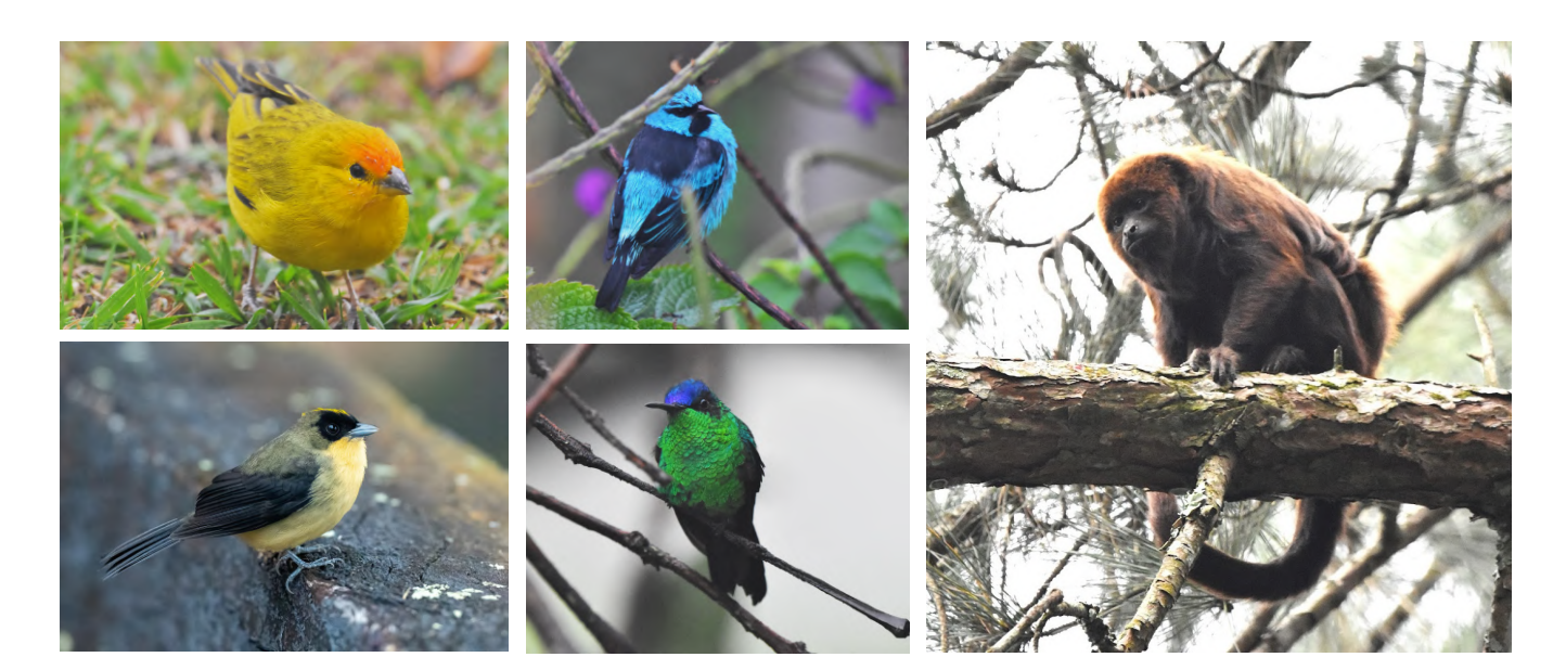
Hotel do Ype had a stunning array of feeders which treated us to Chestnut-bellied Euphonia, Green Headed-Tanager and Swallow-tailed Hummingbird during our pre-lunch arrival.

It was after lunch that we did our first foray into the Forest. Vines, palms, and other trees covered the hills surrounding the hotel, and there were plenty of birds to find. Highlights from this first afternoon were Blackeared Fairy, White-spotted Woodpecker, Cobalt-rumped Parrotlet, Star-throated Antwren and Scalloped Woodcreeper.