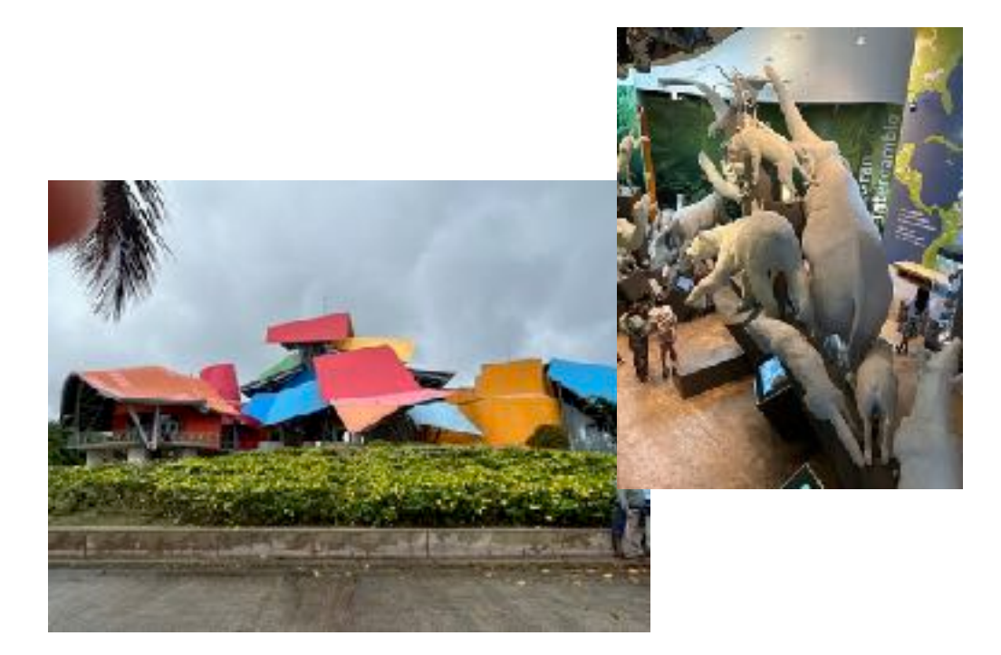
BioMuseo, Amador Causeway

September 30: Canopy Tower, Gatun Lake Boat Ride, Summit Gardens