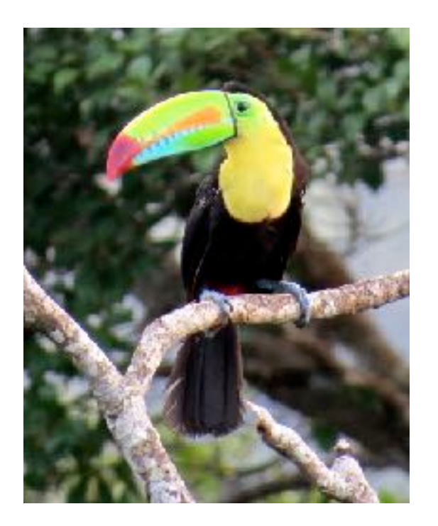
Keel-billed Toucan We learned that toucan bills are filled with capillaries that can help the birds thermoregulate.

Tinamous - Tinamidae Great Tinamou, Tinamus major Little Tinamou, Crypturellus soui (HO)