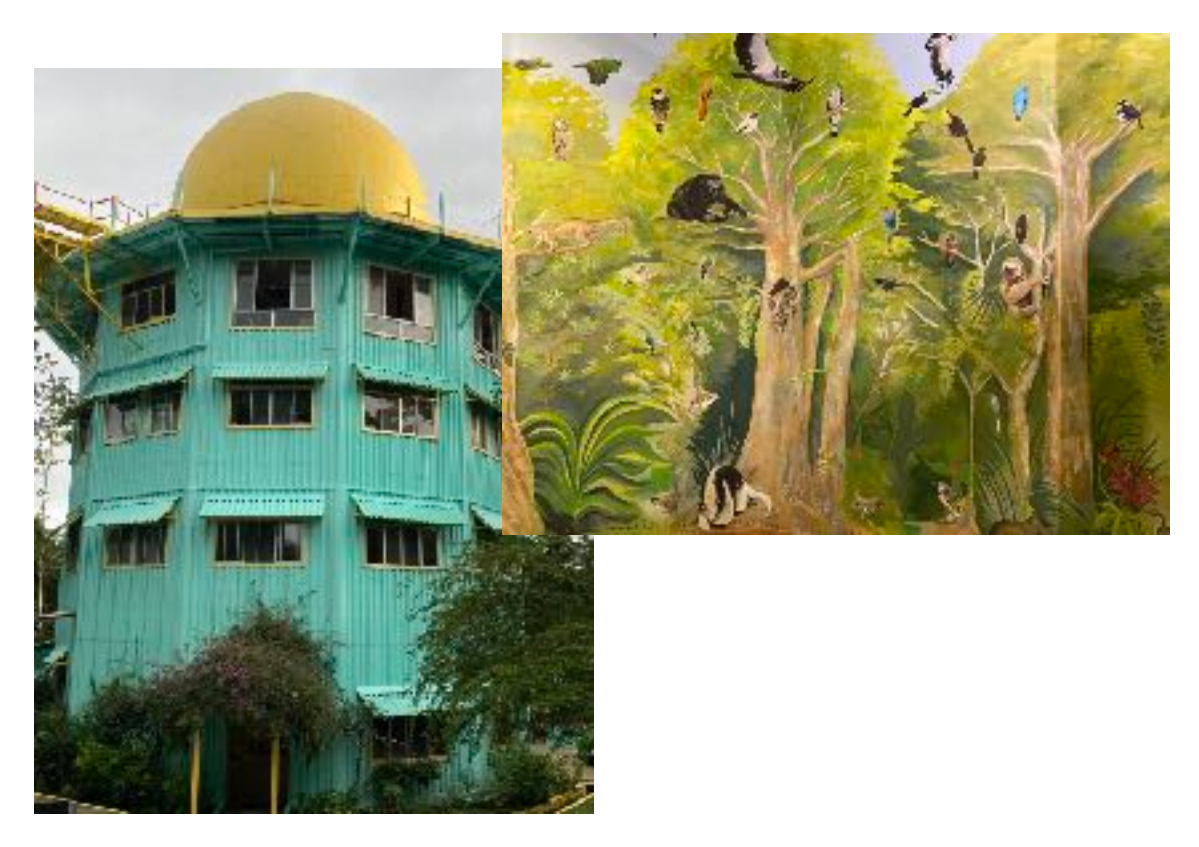
Canopy Tower

A whopping 17 participants arrived at the Canopy Tower, eager to learn everything they could about the biodiversity of the region. Our two scientists and local Canopy guides quickly made everyone feel welcomed.