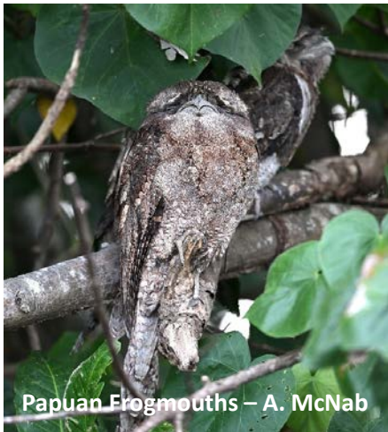
Papuan Frogmouths