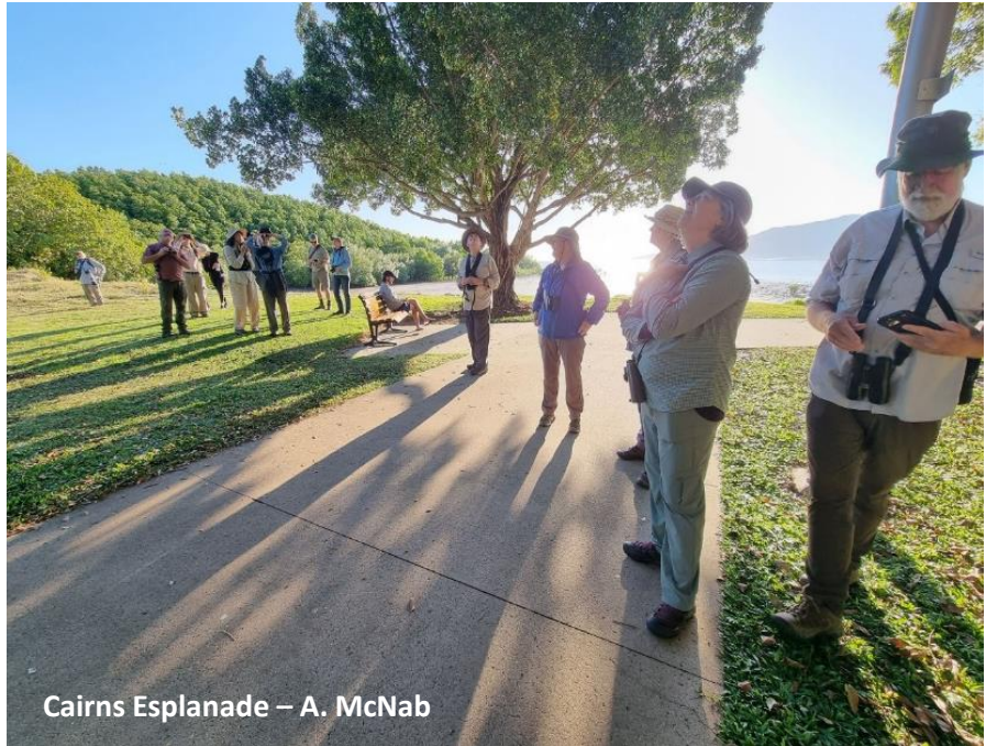
Cairns Esplanade