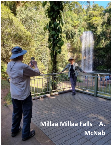
Millaa Millaa Falls