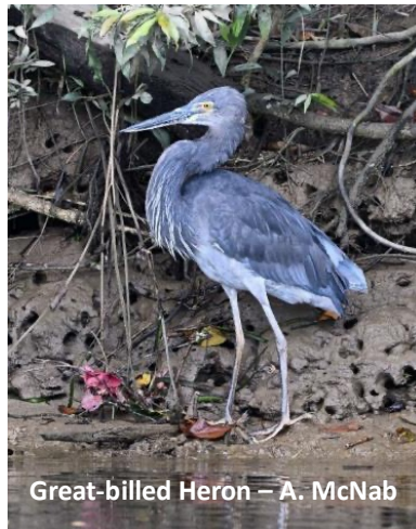
Great-billed Heron